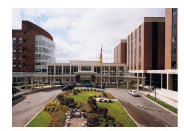
Strong Memorial Hospital 601 Elmwood Avenue Rochester, NY 14642

If you have any questions, please contact URMC Hotel and Lodging Services at (585) 275-7581.