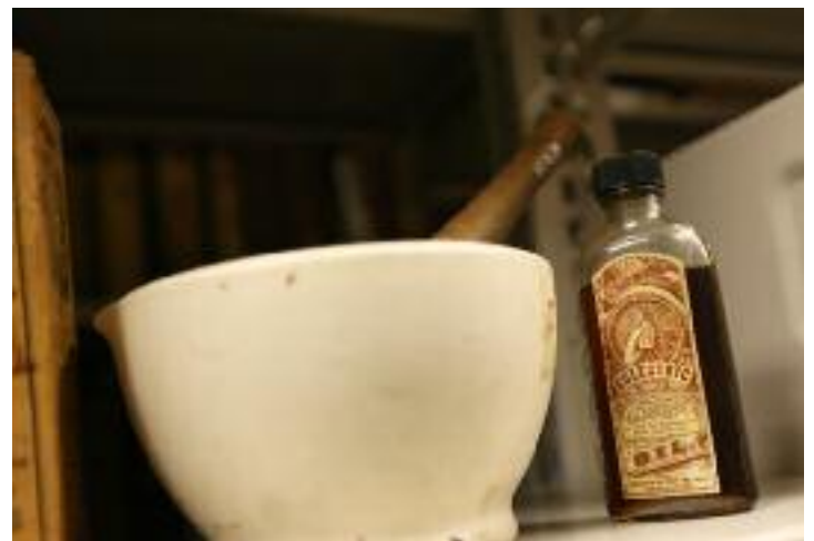
In addition to books, the Miner archives hold a Nobel Prize and collections of tools once used to practice medicine.

is undoubtedly why fewer people are using the rare books housed at Miner.