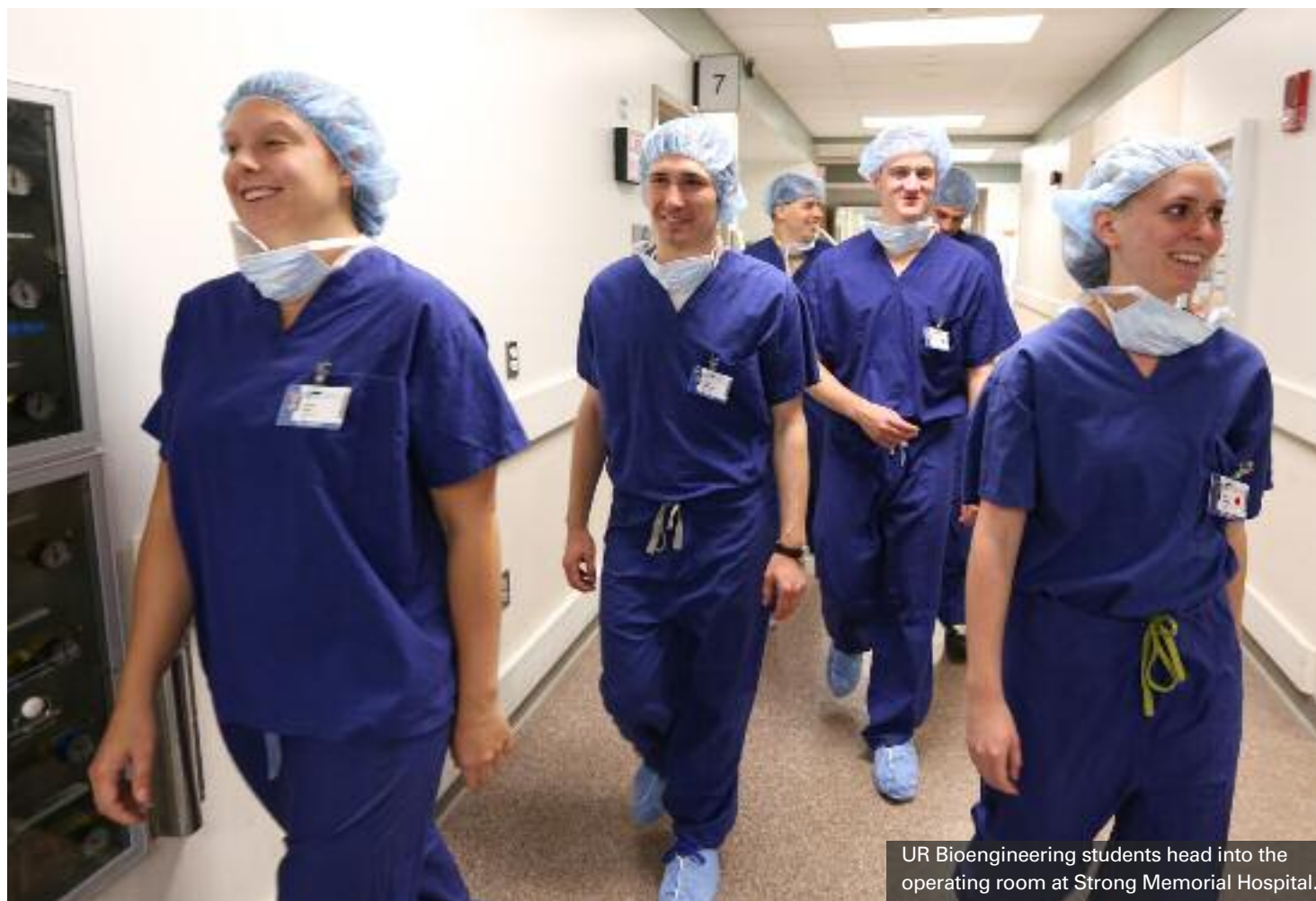
UR Bioengineering students head into the operating room at Strong Memorial Hospital.