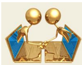
Technology Forum April 22, 2010

7th District Dental Society Semi-Annual Meeting and 16th Annual Handelman Conference April 22-23, 2010