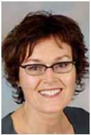
Lynne Maquat, Ph.D. RNA metabolism in mammalian cells; Nonsense-mediated mRNA decay (mRNA surveillance); Influence of pre-mRNA splicing on mRNA translation