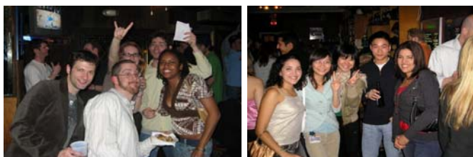
Spring Bar Nights at On The Rocks (left) and at Monty's Korner.

This year we plan to do all that and more!