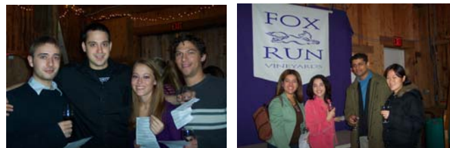
Seneca Lake Wine Tour 2006

When you aren't attending our events be sure to check out other Rochester area goodies such as: Boulder Coffee Co which is a coffee house with a regular music schedule, and an open mic night on Wednesdays; the Bug Jar, featuring unique live bands almost every night of the week; or Artisan Works, an art gallery where you can actually see art being made (and it's also for sale).