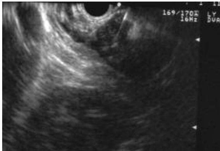
An EUS/fine-needle aspiration of an adrenal mass, in a patient with lung cancer, confirmed inoperable Stage IV malignancy.