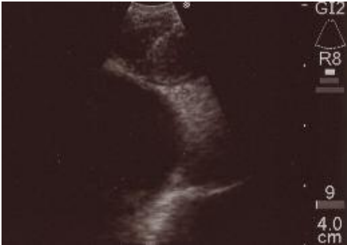
This EBUS-guided biopsy of a 1.2cm left paratracheal lymph node revealed adenocarcinoma of the lung.

“Proper staging is important because the survival rates for lung cancer vary widely by stage, and treatment is dictated by the stage of a patient’s cancer,” Nead said. “EUS and EBUS allow us to reach areas that are frequently missed by other techniques, or that would require a more extensive surgery to reach, such as the hilum. These endoscopes are terrific tools to add to the armamentarium of Pulmonary, GI, and Thoracic Surgery.”