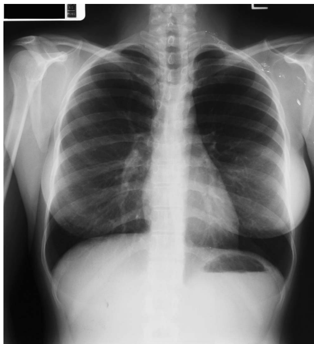
Fig. 1. Chest radiograph (PA view).

We explained in detail to the patient and her husband the risks of prenatal mercury exposure to the fetus. In the case of methyl mercury exposure, adverse effects on the offspring include microcephaly; mental and neurological disturbances; ataxia; tremor; impairment of speech, gait, and vision development; cerebral palsy; as well as mental retardation and