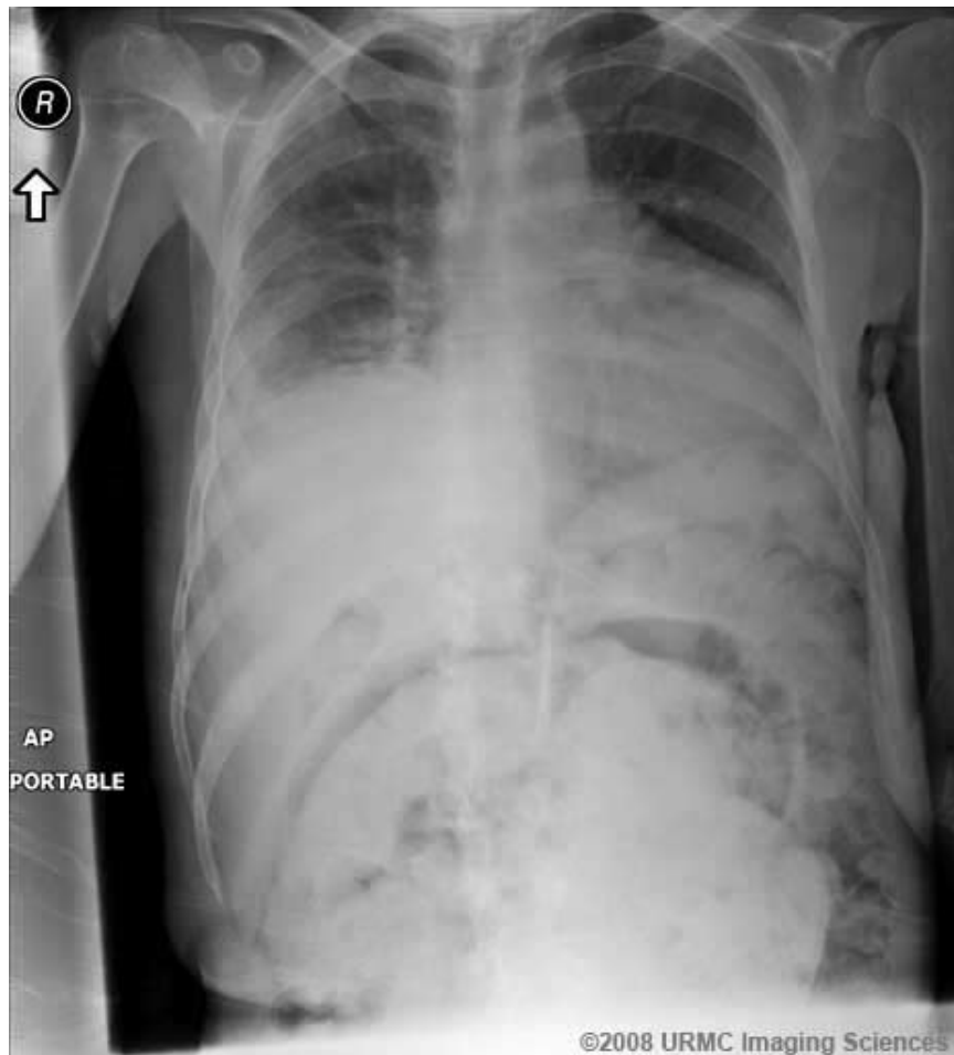
Figure 3 (Case 2): Abdominal radiograph shows a large, high-density mass arising from the pelvis, and possible free air.