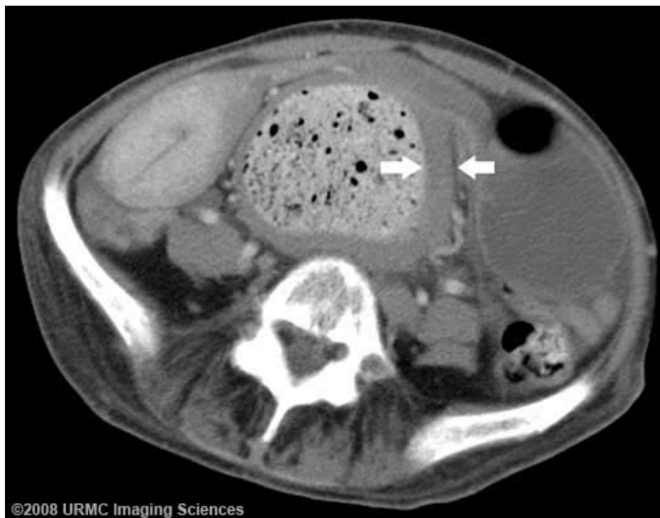
Figure 4 (Case 2): CT at the level of the pelvis demonstrates a large fecolith in the sigmoid colon. There is diffuse colonic wall thickening (arrows), concerning for stercoral colitis.