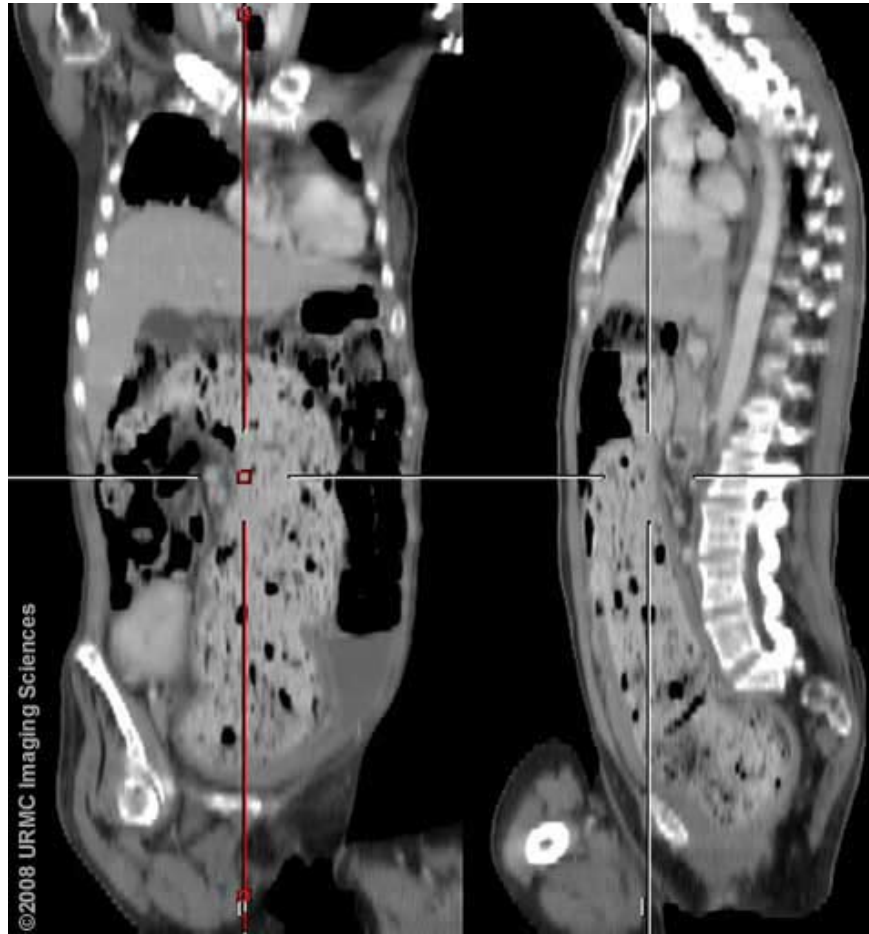
Figure 5 (Case 2): CT coronal and sagittal reformats show the fecal impaction to involve most of the sigmoid colon. Colonic wall thickening is evident.