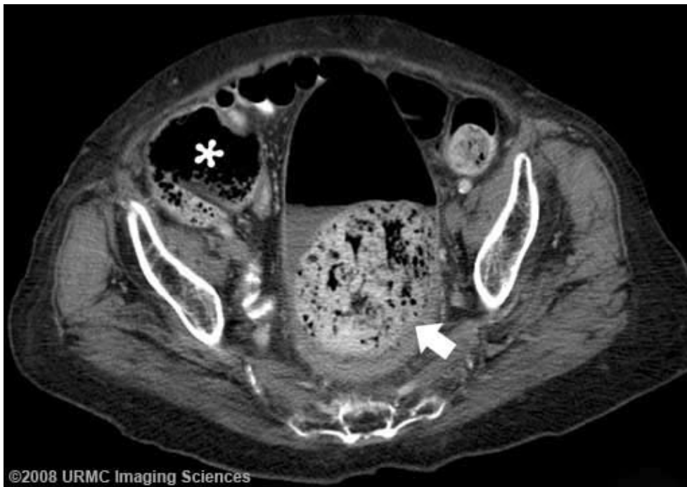
Figure 2 (Case 1): CT at the level of the pelvis demonstrates a large fecolith in the rectosigmoid region (arrow). Note cecum is also dilated consistent with colonic obstruction (asterisk).