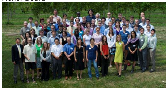
Retreat, Ventosa Vineyards