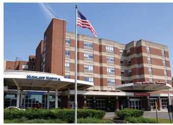
Highland Hospital 1000 South Avenue Rochester, NY 14620