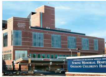
Golisano Children's Hospital 601 Elmwood Avenue Rochester, NY 14642