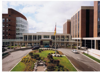
Strong Memorial Hospital 601 Elmwood Avenue Rochester, NY 14642

If you have any questions, please contact URM Hotel and Lodging Services at (585) 275-7581.