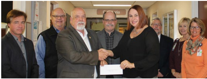
This year, the Scio Lions Club donated the proceeds of its first dice run - $2,452 – to the Diabetes Center.

fitness. All funds raised by these two events are put back into the community for activities that encourage wellness, like the Hydration Stations installed at the Wellsville YMCA and at the hospital. The Wellness Committee also provides incentives for donors who attend the Community Blood Bank Drives at Jones Memorial Hospital.