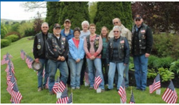
After five years, the Field of Flags has been able to donate over $9,500 to LEEK Hunting & Mountain Preserve. The annual Field of Flags is a joint effort of JMH, American Legion Post 702 and Auxiliary, Sons of the Legion, and Legion Riders.

fitness. All funds raised by these two events are put back into the community for activities that encourage wellness, like the Hydration Stations installed at the Wellsville YMCA and at the hospital. The Wellness Committee also provides incentives for donors who attend the Community Blood Bank Drives at Jones Memorial Hospital.