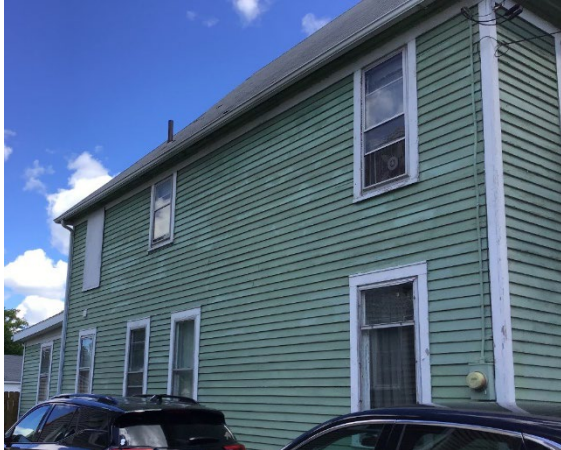
Siding: Before and After