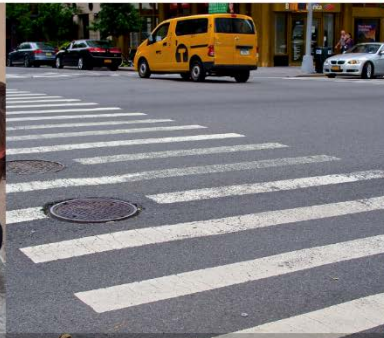
Featured A FORMER BUSINESS OWNER'S STORY