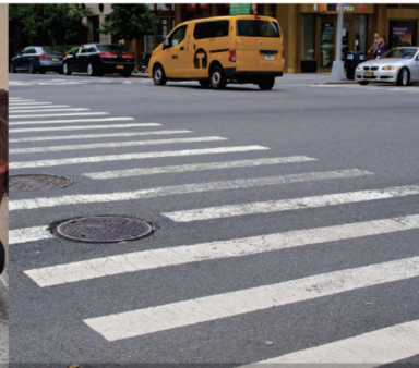
Featured A FORMER BUSINESS OWNER'S STORY