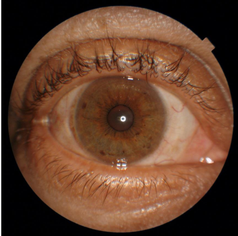
Undilated pupil- may create shadows/darker areas in images- good focus