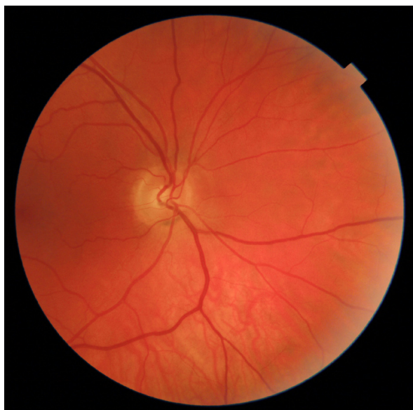
Optic Disc Centered