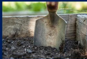
Legacy pollution (brownfields, hazardous waste, contaminated soil)