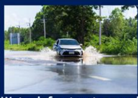
Water infrastructure and flooding