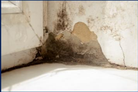
Housing quality and environmental exposures