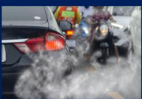
Outdoor air quality