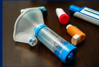
Inequities in environmental exposures and access to resources (Environmental Justice)