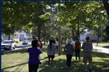
Greenspace and urban tree canopy