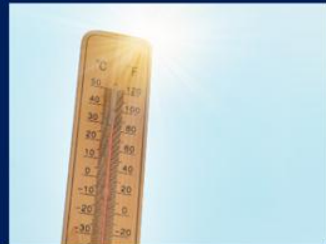
Heat (indoor, outdoor, and occupational exposure)