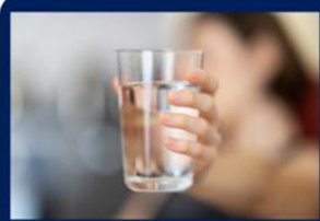
Drinking water quality