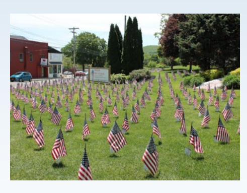
Field of Flags: Thank you to everyone who supported the 2023 Field of Flags, an annual event to remember our deceased veterans. This year's field has over 400 flags waving in the breeze from Armed Forces Day through Memorial Day. Proceeds go to the LEEK Hunting Preserve for wounded veterans.

Wellness Fair: When the Wellness Committee began offering free health and wellness screenings, Northern Lights Candles, a cornerstone donor, was one of the first local businesses to take advantage of this community service.