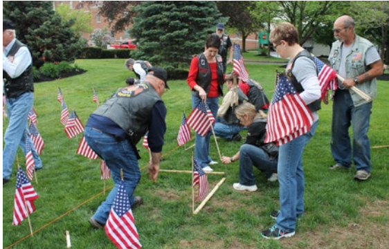
Members of the Wellsville American Legion and Auxiliary, the Legion Riders, and the Sons of the American Legion, teamed up with JMH to put up a Field of Flags in memory of deceased veterans.