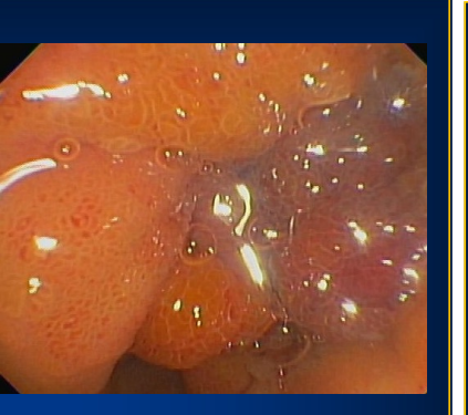
Figure (B) Fixed luminal narrowing in the duodenal sweep due to mucosal nodularity, edema, friable mucosa and ulcerations.