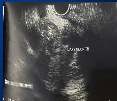
Figure (C) EUS demonstrating luminal narrowing in duodenal sweep, hypoechoic soft tissue area in gallbladder neck with drains traversing area.

Figure (B) Fixed luminal narrowing in the duodenal sweep due to mucosal nodularity, edema, friable mucosa and ulcerations.