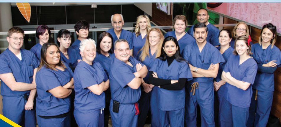
Special thanks to all the providers, nurses and staff of the Division of Gastroenterology & Hepatology who made this event possible.

Attendance: Limited to 240 people for the didactic component of the course. Hands-on workshop limited to the first 84 (of above 240) registrants.