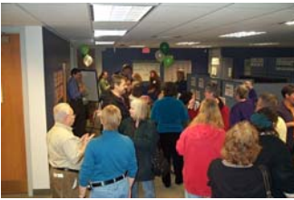
Open House visitors packed NCDHR offices and hallways.