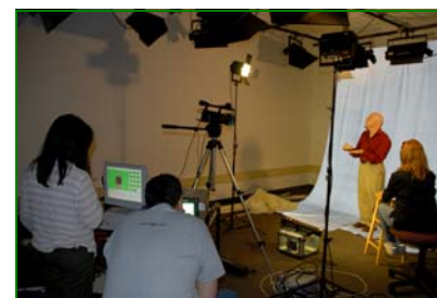
Filming of the Deaf Health Survey at RIT.

The survey will display videos in ASL, English-like sign language and captioning. Most of all, thank you for your input and support of NCDHR.