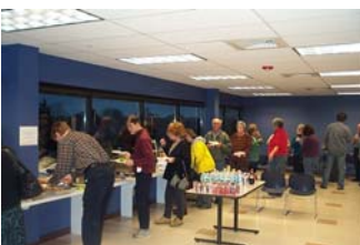
Visitors lining up to enjoy Italian-style buffet at NCDHR.