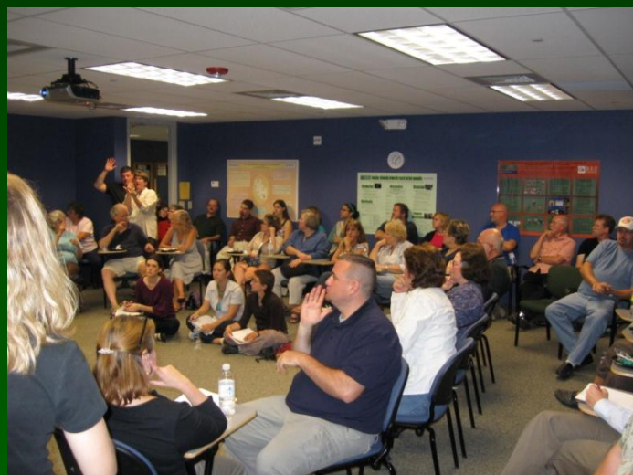
At Corporate Woods ↑