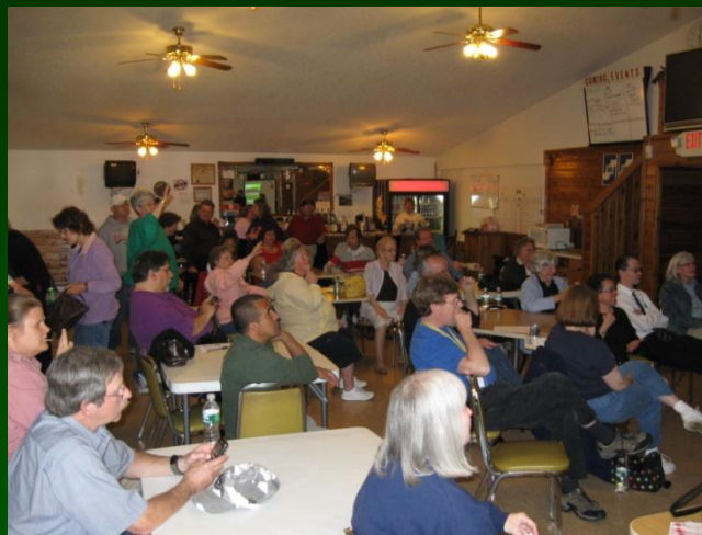
At Deaf Club