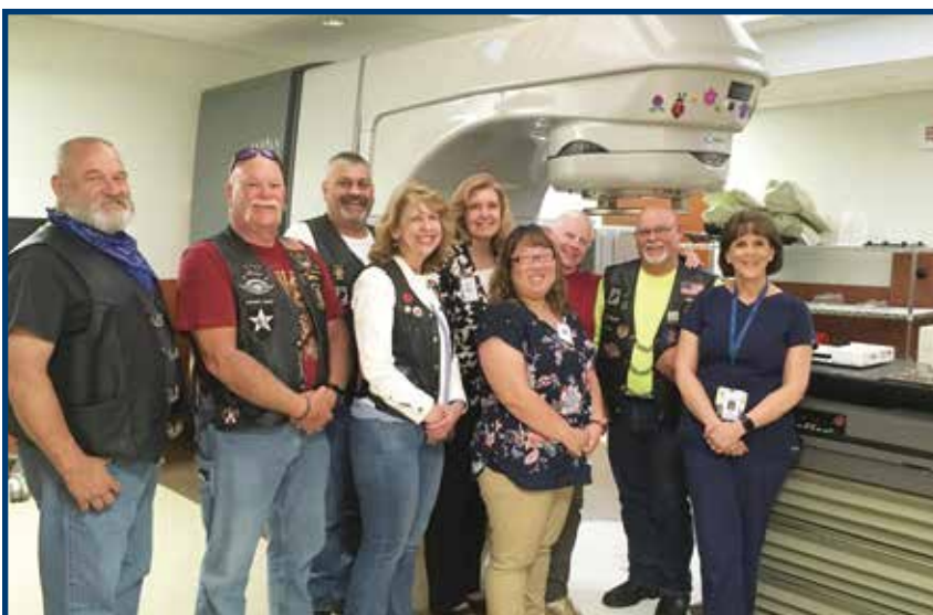
The American Legion Riders, USToo of Rochester and UR Medicine|Noyes Health collaborated on a Blue Ribbon Ride for Prostate Cancer on June 10, 2018. Proceeds from the ride went to USTOO of Rochester, a prostate cancer awareness and support organization, and to the Ann and Carl Myers Cancer Center to support transportation needs for prostate cancer patients. A total of $3,900 was raised and split between the two organizations.