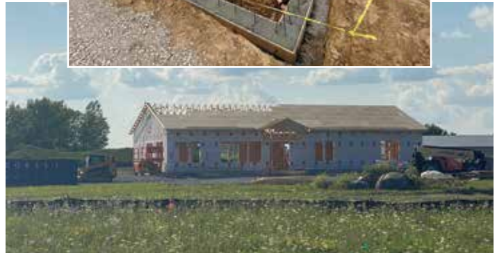
The official groundbreaking for UR Medicine Noyes Mental Health and Wellness building in Avon was held June 16. The building is expected to open and start seeing patients at the end of 2021 or beginning of 2022.