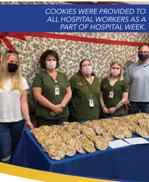
COOKIES WERE PROVIDED TO ALL HOSPITAL WORKERS AS A PART OF HOSPITAL WEEK.