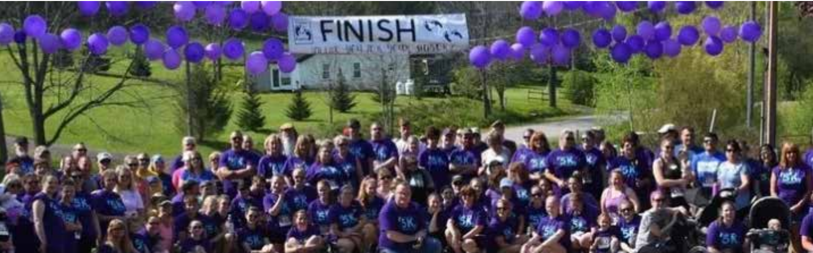
PARTICIPANTS IN THE FOOTIN' IT FOR FAMILY 5K POSE FOR A PHOTO. THE EVENT RAISED $25,000 FOR THE ANN AND CARL MYERS CANCER CENTER.

Noyes Memorial Hospital 111 Clara Barton St. Dansville, NY 14437 www.noyes.urmc.edu