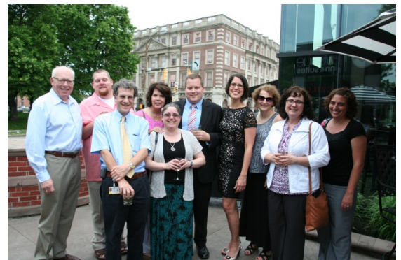
Infectious diseases faculty, fellows and family members celebrated the graduating fellows in ID.

9-month Clinical Instructor appointment in Pediatric Infectious Diseases followed by a fellowship in Adult Infectious Diseases, University of Rochester Medical Center, Rochester, NY