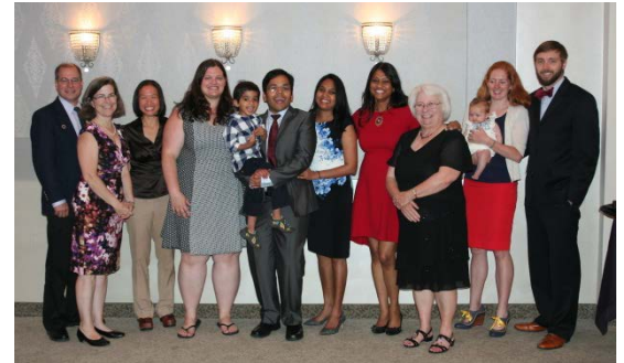
Neonatology faculty, fellows and family members celebrated the graduating fellows.