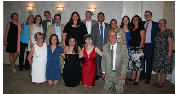
Pediatric fellows, faculty and mentors at the 2016 fellowship graduation dinner.

Cohen Children's Medical Center, New Hyde Park, NY