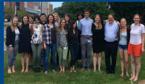
(CARE Block 2017)

"Connecting, Advocating, Researching, and Educating in our communities to do what works for health"