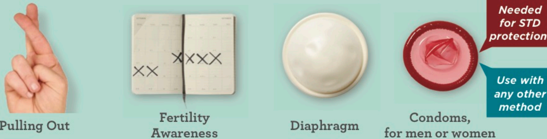
Pulling Out Fertility Awareness Diaphragm Condoms, for men or women