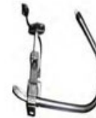
SIP & PUFF