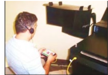
Voter at BMD Screen