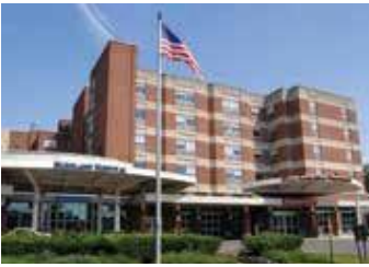
Highland Hospital 1000 South Avenue Rochester, NY 14620

* Reservations for these hotels can be made directly through Strong Hotel & Lodging Services from Monday through Friday 8am – 4pm at (585) 275-7581. During any other time, please call the hotel directly.