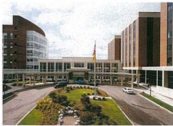
Strong Memorial Hospital 601 Elmwood Avenue Rochester, NY 14642

If you have any questions, please contact URMH Hotel and Lodging Services at (585) 275-7581.