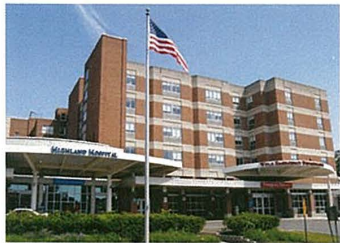
Highland Hospital 1000 South Avenue Rochester, NY 14620