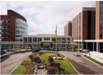
Strong Memorial Hospital 601 Elmwood Avenue Rochester, NY 14642

If you have any questions, please contact URMCHotel and Lodging Services at (585) 275-7581.