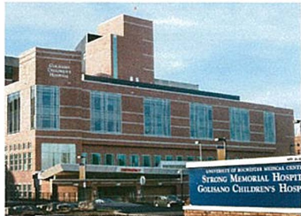
Golisano Children's Hospital 601 Elmwood Avenue Rochester, NY 14642