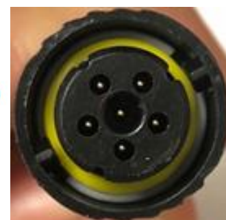
Figure 2 – Front view of Power Source Connectors

Below is a summary of the changes to the cleaning instructions for the Controller AC Adapter, DC Adapter, and Battery: