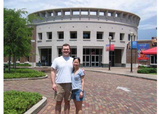
The Orlando Art Museum satisfied our palate for Glass Art

This year's AAO annual session was held in Orlando, FL from April 30 to May 4. The Class of 2004 took their Phase II ABO Examination in Orlando before the meeting commenced. All residents were fortunate enough to attend lectures, meet other orthodontists and peruse the exhibition hall. During breaks in the schedule, some visited Disney theme parks with families and friends. There were some very interesting talks by well-known individuals from the profession. As usual, there was a great turnout for the EDC alumni reception; old friends and colleagues were united once again and memories of HOT SEAT resurfaced!