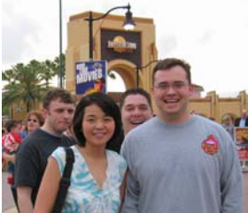
Universal Studios here we come!

This year's AAO annual session was held in Orlando, FL from April 30 to May 4. The Class of 2004 took their Phase II ABO Examination in Orlando before the meeting commenced. All residents were fortunate enough to attend lectures, meet other orthodontists and peruse the exhibition hall. During breaks in the schedule, some visited Disney theme parks with families and friends. There were some very interesting talks by well-known individuals from the profession. As usual, there was a great turnout for the EDC alumni reception; old friends and colleagues were united once again and memories of HOT SEAT resurfaced!