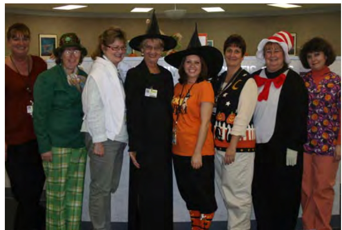
Ortho dedicated staff with a display of Halloween magic for the patients.