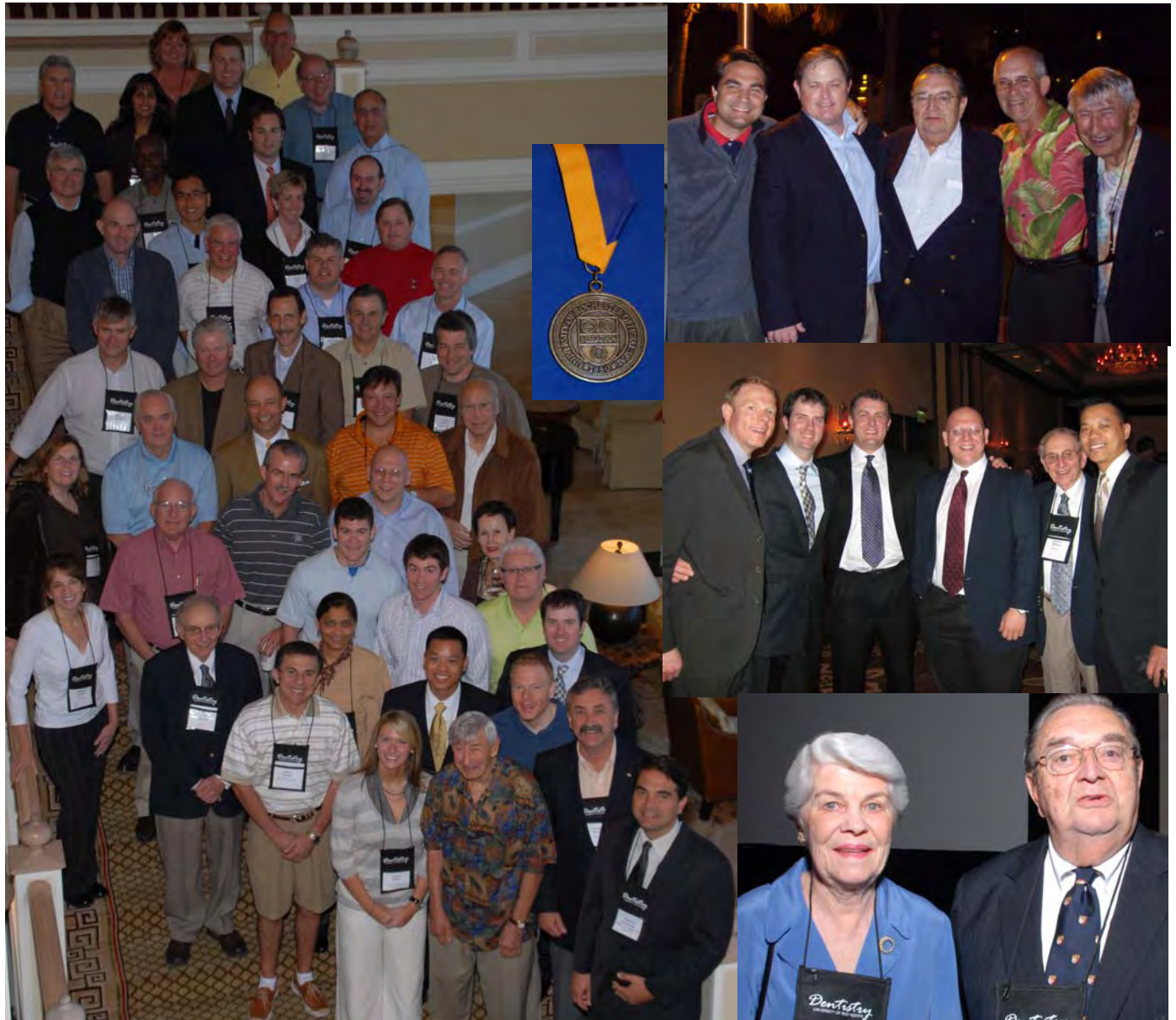
(Below is the J. Daniel Subtelny Professorship medal.)