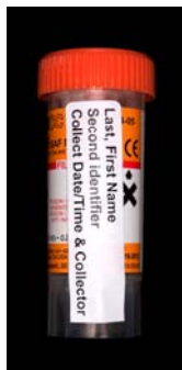
Parasite (O&P) SAF Vial

Stable room temp Deliver to lab within 72 hours after collection