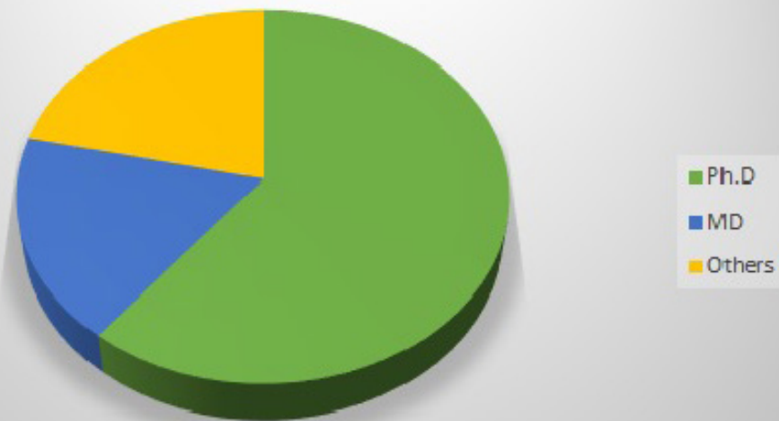
CSDD-2015 Participants Affiliation