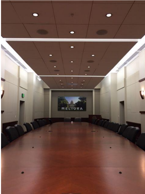
The Board Room

Smaller conference rooms at the Bloch Center have limited availability due to Advancement use.