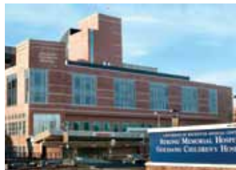
Golisano Children's Hospital 601 Elmwood Avenue Rochester, NY 14642