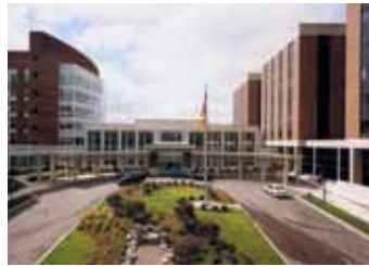
Strong Memorial Hospital 601 Elmwood Avenue Rochester, NY 14642

If you have any questions, please contact URMH Hotel and Lodging Services at (585) 275-7581.