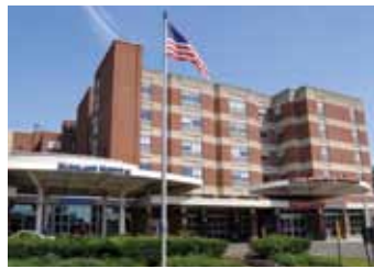
Highland Hospital 1000 South Avenue Rochester, NY 14620