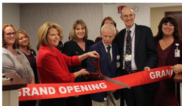
Wilmot Cancer Institute Infusion Center ribbon cutting

In early 2017, Jones Memorial, Wilmot Cancer Institute, and Noyes Health collaborated to establish The Ann and Carl Myers Cancer Center, a regional cancer treatment center. Located on the Noyes campus in Dansville, the Myers Cancer Center offers radiation therapy. The regional approach to cancer care was augmented when the Wilmot Cancer Institute Infusion Center at Jones Memorial Hospital was opened on the third floor at Jones later that year.