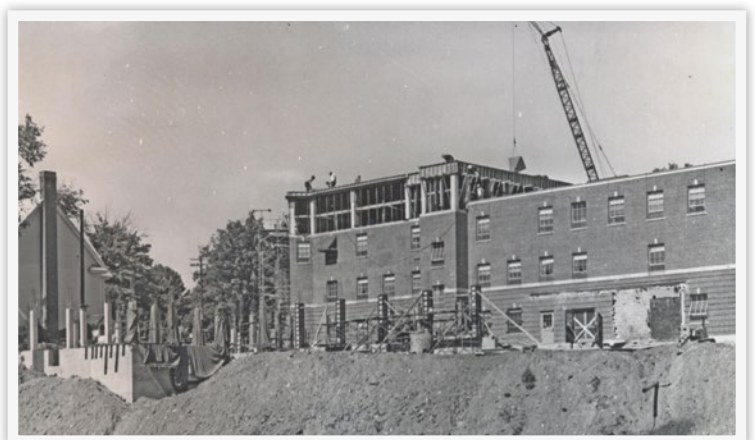
Addition of the third floor

Jones Memorial Hospital – and the community – continued to grow. In 1968, a third floor was built between the existing stairways and a two-and-a-half story west wing was built. A $600,000 Capital