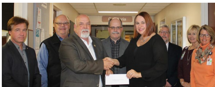
The Scio Lions Club makes a gift to the Wellsville Lions Clubs Diabetes Center, 2018