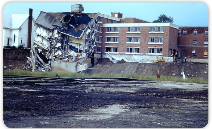
Hurricane Agnes caused the collapse of the hospital's west wing in 1972.