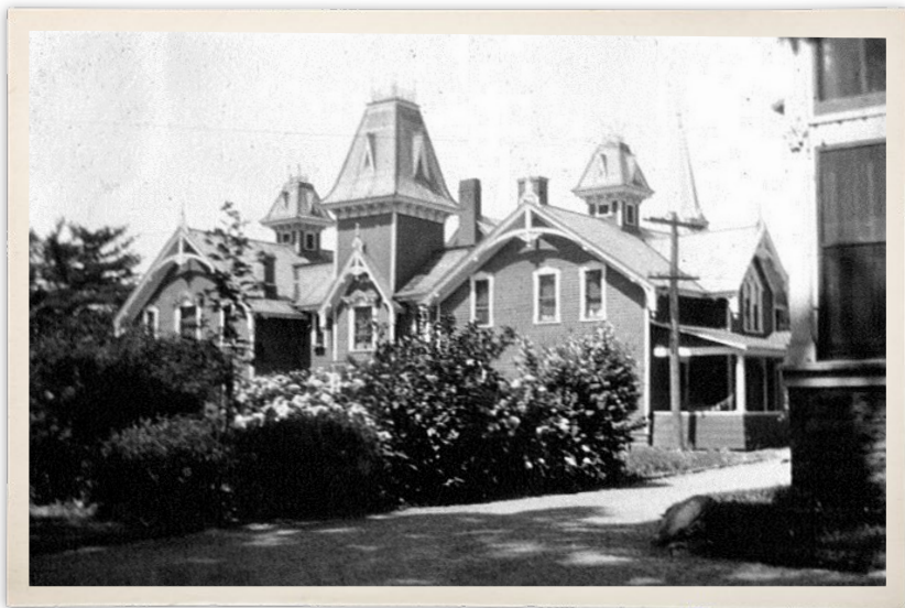
Home built for the Nurses