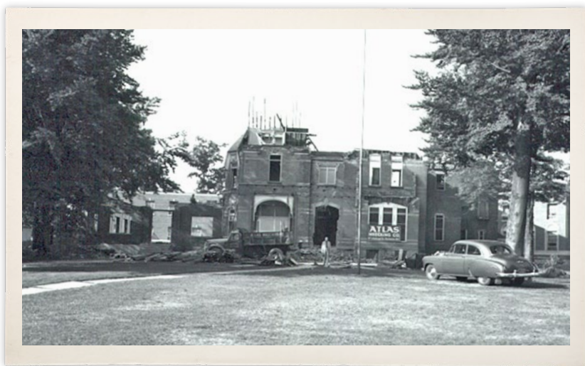
Original hospital buildings under demolition