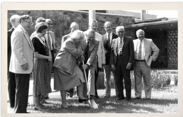
1991 Groundbreaking ceremony

As a community hospital, one of the continuing motivations has been expanding and adding services that meet the needs of the residents of this community. This growth can be seen in many hospital departments including Rehabilitation and the Jones Memorial Medical Practices, a primary care network of physicians and healthcare providers with specialties including Obstetrics and Gynecology, Pediatrics, Internal Medicine, Pulmonology, Orthopaedics, and Family Practice. The hospital now operates a Walk-In Clinic which is open seven days a week from 2 pm to 7 pm.